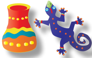
Art and Crafts