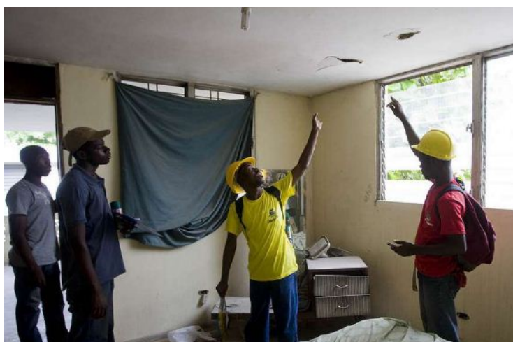
Trained contractors assess the damage in a yellow tagged house.

PADF will work alongside Haiti's Ministry of Public Works and community leaders to identify specific neighborhoods for repairs, hire workers, and help manage the project.