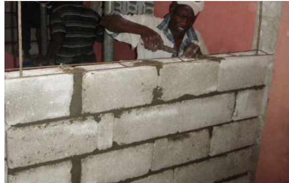
A PADF worker repairs the walls of a damaged home.